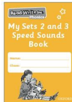
Practise reading and writing sounds in My Sets 2 and 3 Speed Sounds Book .

Ask your child to flick through the book and read the sounds as quickly as he or she can. If your child hesitates reading a sound, the picture is on the back as a reminder. Your child can also practise writing the sound on the same page.