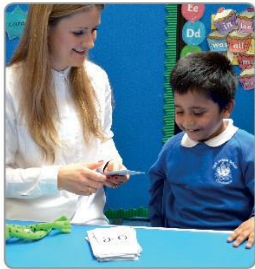
Learning the Speed Sounds in the classroom.